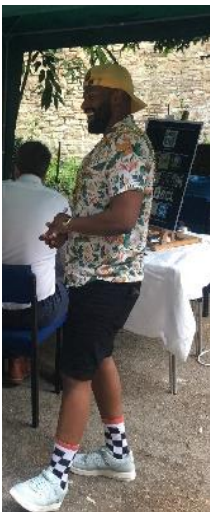
The Lord Mayor at the BBEST 'Countdown to the Consultation' Forum 7/7/18

Councillor Magid, Lord Mayor of Sheffield 2018-19 (Cllr Magid was a member of the BBEST Steering Group from 2016-2019)